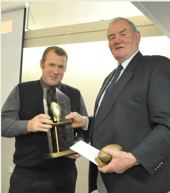
Sir Brian Lochore Trophy for Club of the Year sponsored by Gilbert Rugby: Eketahuna Rugby Club