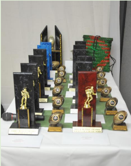
Wairarapa Bush Trophies