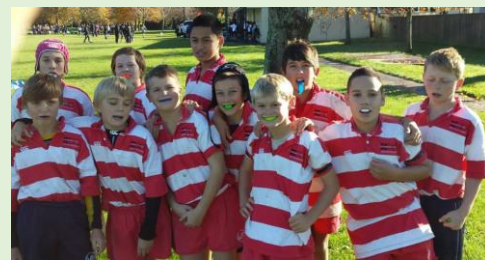
(MIS 7's Team - Great to see your Mouthguards)