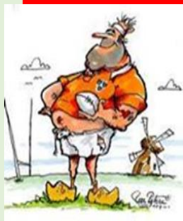
Dead Ball Charlie's Highlights of the week