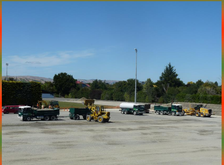
Higgins Crew hard at Work on No 1