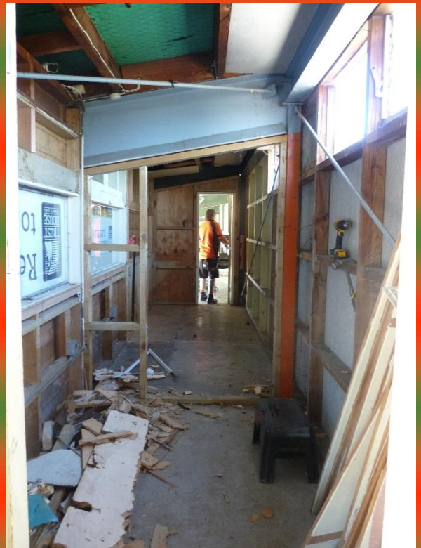
Announcers /Coaches Box Gets a make over