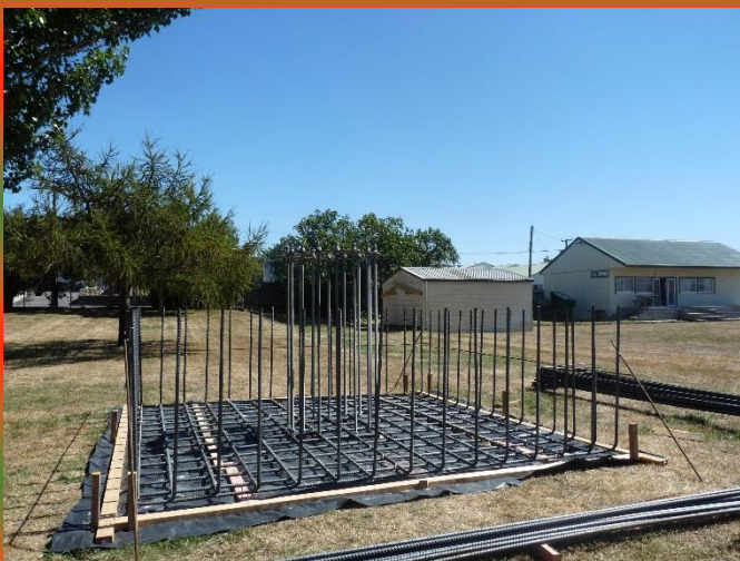
Moulds for the Light towers