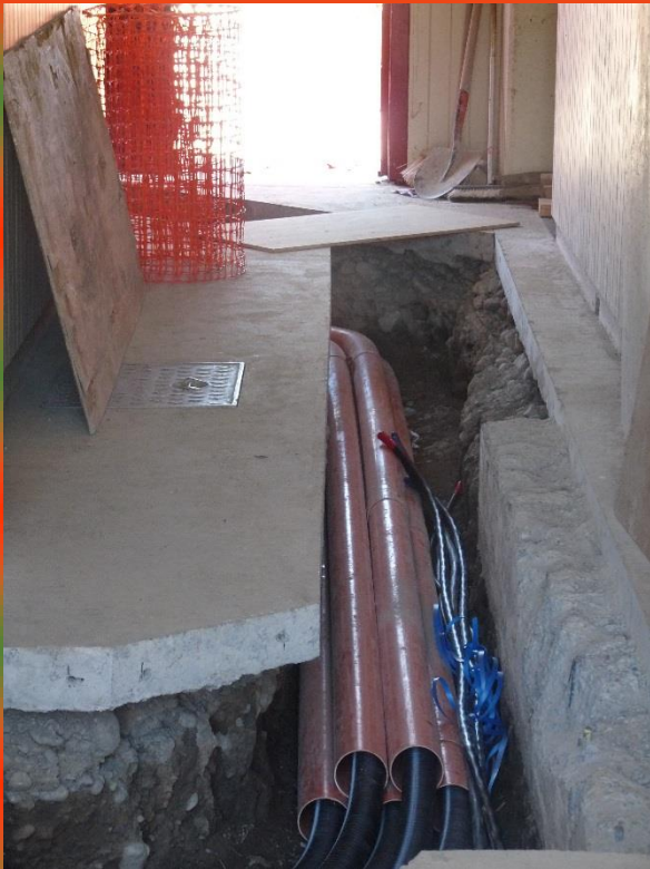
Power cables for the lights on No 1