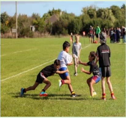
What Saturdays are all about before the big game