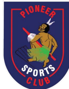
Pioneer Old Boys